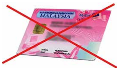
Sample of MyKid card.